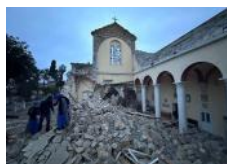
The destroyed Cathedral of Iskenderun.

A 7.8 magnitude earthquake has unleashed devastation on Turkey and Syria, leaving thousands of people dead with this number expected to rise dramatically. After 12 years of war, Syria is at breaking point and desperately needs assistance.