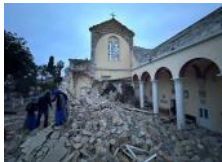
The destroyed Cathedral of Iskenderun.

A 7.8 magnitude earthquake has unleashed devastation on Turkey and Syria, leaving thousands of people dead with this number expected to rise dramatically. After 12 years of war, Syria is at breaking point and desperately needs assistance.